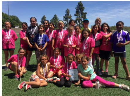
Girls on the Run finished their practice 5K at Valley in April