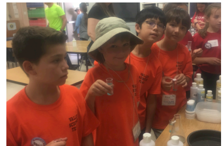
Science Field Day 2017