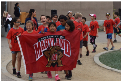
Field Day Fun!