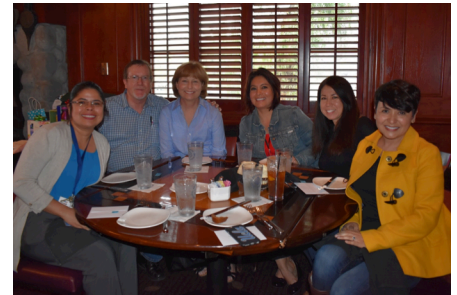
Our wonderful Teachers and Staff enjoying lunch at the Brigantine during Teacher/Staff Appreciation Week