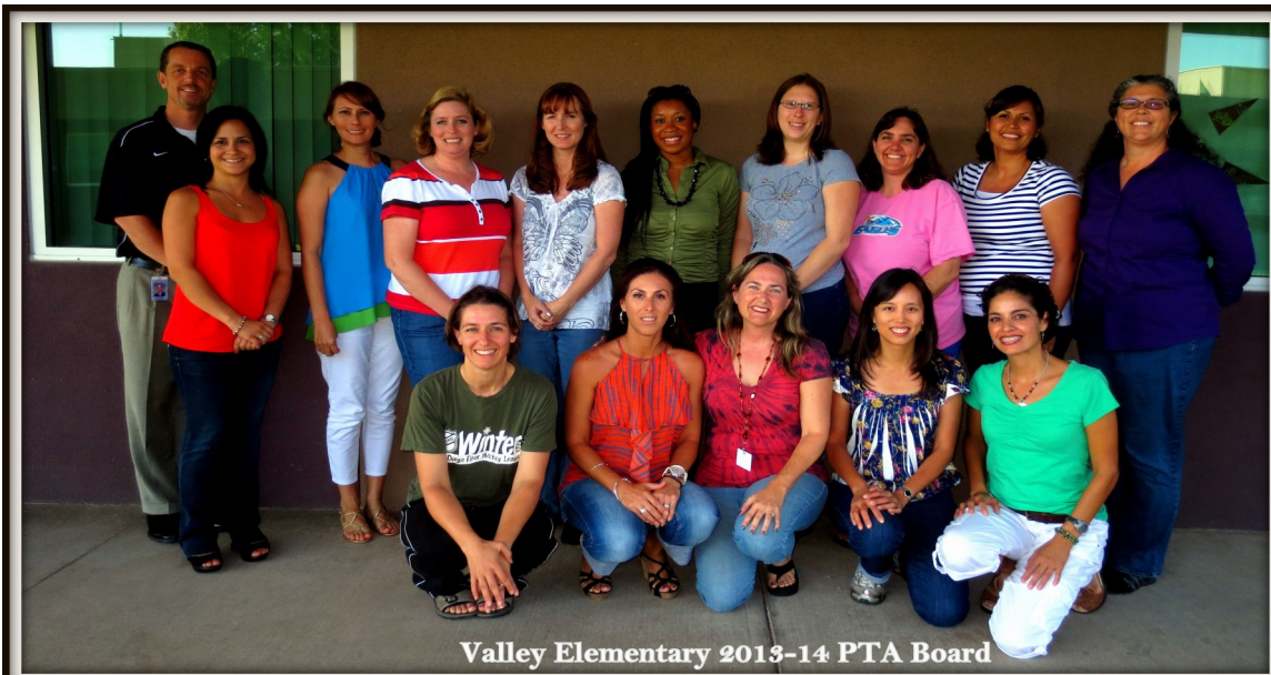
Valley Elementary 2013-14 PTA Board