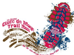
Cinco de Mayo Trail Run 5/3/14 Page 2