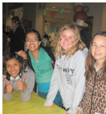
Art in the Valley Page 3