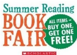
Summer Book Fair 3/24-3/28 Page 4