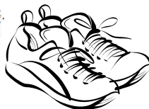
Jog-A-Thon 3/19/14 Page 3